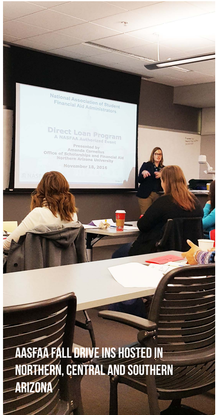
AASFAA FALL DRIVE INS HOSTED IN NORTHERN, CENTRAL AND SOUTHERN ARIZONA

For any out of staters looking for an excuse to come to a warmer climate, come to our conference and come early for Student Employment Essentials (SEE) Training hosted by WASEA on Tuesday April 25 - Wednesday April 26!!